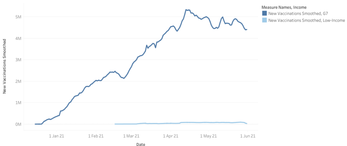
Average daily vaccinations in G7 and LICs, Dec 15 2020 to May 31 2021

As of the end of May 2021, the G7 had administered 524 million doses. 41% of G7 citizens have had at least one vaccine. While the G7 countries, except for Japan, are registering an impressive vaccination campaign, the situation is grievous for the world's poorest countries who, at the current rate, will take 57 years to fully vaccinate their population, according to a People's Vaccine tally . The world's low-income countries, that together have a similar population to the G7 have given one dose per hundred people at the end of May. Africa, with its 1.34 billion people, had vaccinated a meagre 24.5 million people with at least a single dose. In contrast, the United Kingdom alone had given out two times more jabs than the entire African continent despite having a population that is twenty times smaller. The English county of Cornwall, where the G7 is being held, has a population of 566,000 people, and has administered more vaccinations than 22 African countries with a combined population of 345 million people ii .