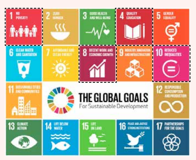
Ph. Global Goals for Sustainable Developmen

The 2030 Agenda <sup>1</sup> is the first international development framework that includes and recognizes migration as a dimension of sustainable development <sup>2</sup>.