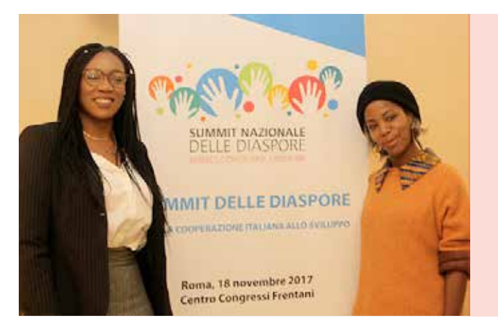
Ph. Summit delle diaspore

Since 2017, the Italian government has supported the creation of the Summit of Diasporas in which both associations of migrants, MAECI, Embassies, the Italian Agency for development cooperation (AICS), local institutions, civil society organizations, discuss on cooperation programs and objectives in order to raise awareness on the linkages between migration and development and to enhance the role of Dia sporas for sustainable development <sup>24</sup>.